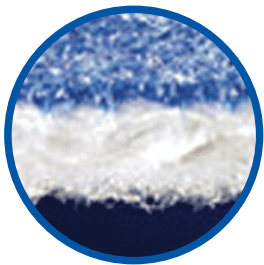
4-Layer, woven base fabric