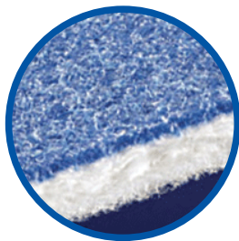
100% heavyweight polyester construction